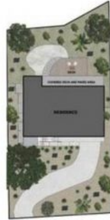
GENERAL SITE PLAN (NOT TO SAME SCALE)